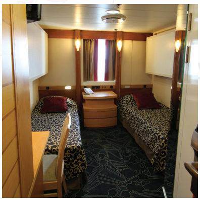
Exterior Twin - Category 5