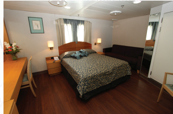
Superior Twin Double Bed - Category 8