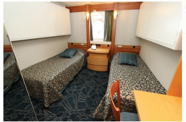
Exterior Twin - Category 4